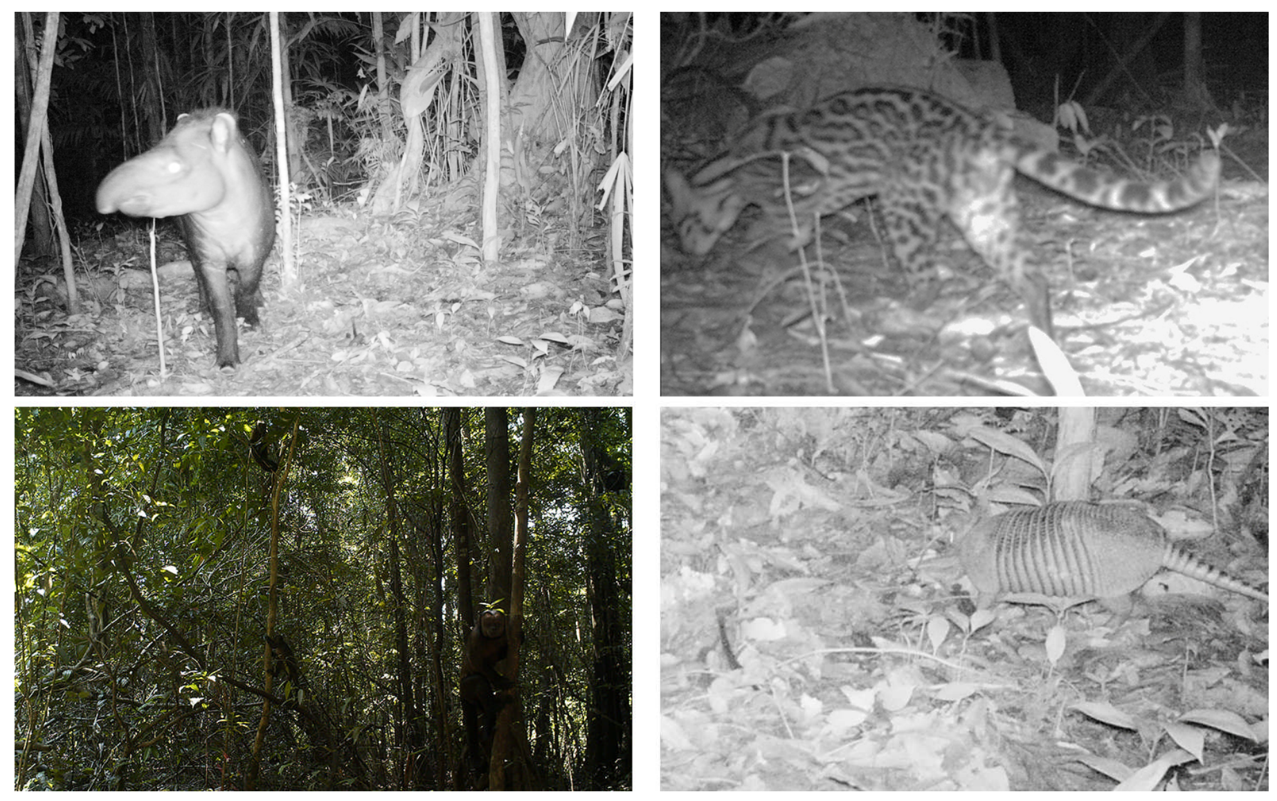
Figure 2.3a. Species recorded by camera traps: Tapir (upper left corner), ocelot (upper right corner), brown capuchin monkeys (lower left corner) and armadillo (lower right corner).