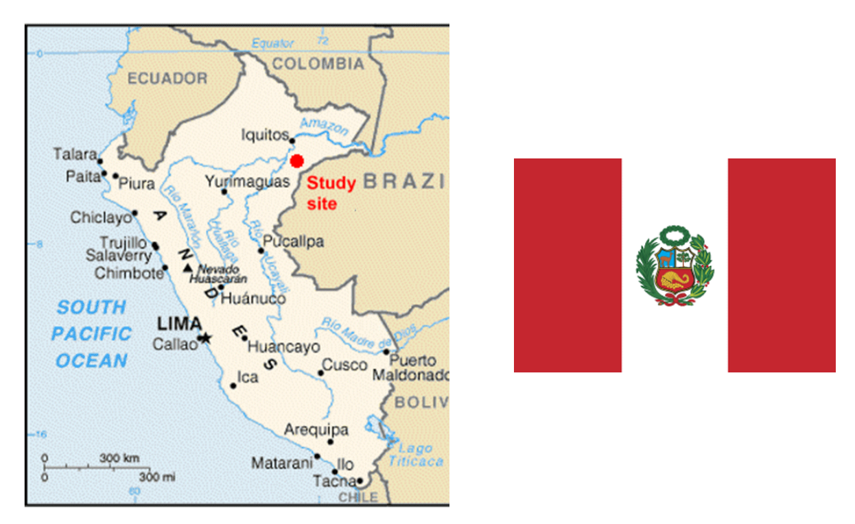
Figure 1.2a Flag and location of Peru and study site. An overview of Biosphere Expeditions' research sites, assembly points, base camp and office locations is at <u>Google Maps</u>.

Peru is located on the Pacific coast of South America and is the third largest country on the continent. Two-thirds of Peruvian territory is located within the Amazon basin. The expedition base camp was within the Loreto Department, which boasts the second largest protected area, the Pacaya Samiria National Reserve (over two million hectares) and also the first Community Regional Conservation Area of the country, TTCRCA of 421,000 hectares.