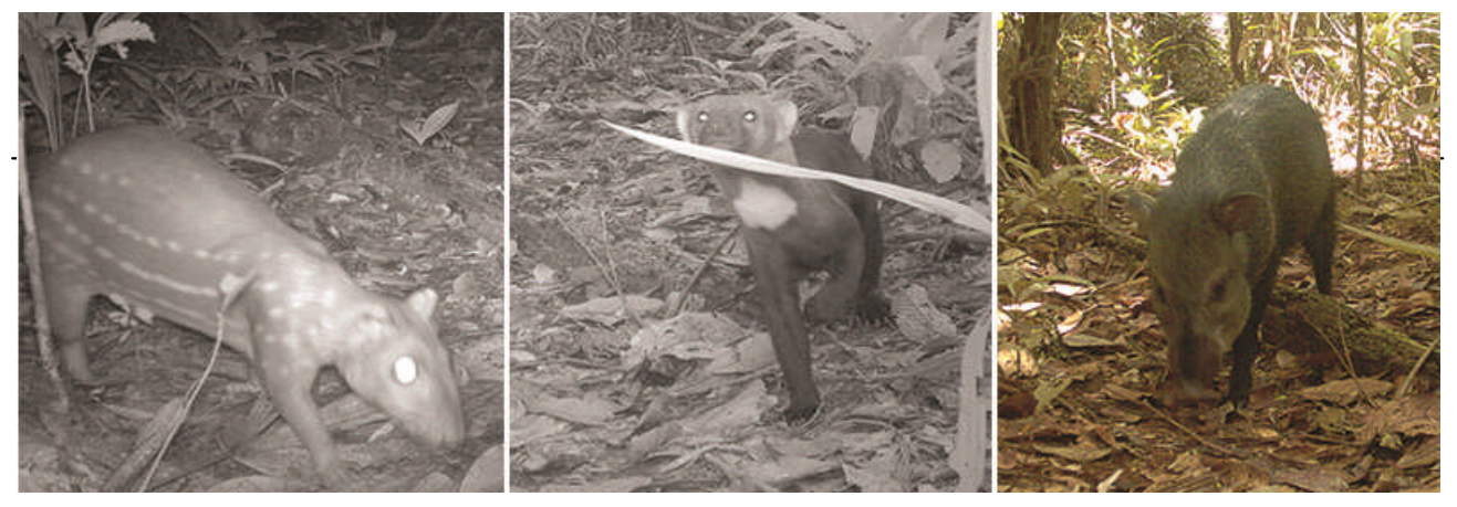
Figure 2.3a. Species recorded by camera traps: Paca (left), tayra (centre) and collared peccary (right).

Table 2.3a. Cells, their number and method of sampling. Resampling for camera trapping = sampling nights.