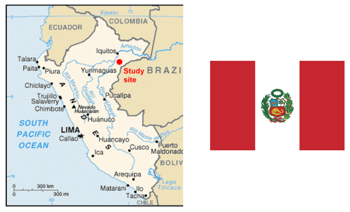
Figure 1.2a Flag and location of Peru and study site. An overview of Biosphere Expeditions' research sites, assembly points, base camp and office locations is at <u>Google Maps</u>.

Peru is located on the Pacific coast of South America and is the third largest country on the continent. Two-thirds of Peruvian territory is located within the Amazon basin. The expedition base camp was within the Loreto Department, which boasts the second largest protected area, the Pacaya Samiria National Reserve (over two million hectares) and also the first Community Regional Conservation Area of the country, TTCRCA of 421,000 hectares.