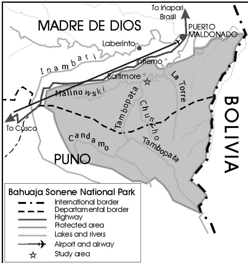
Fig 1.2a. Map of the Tambopata-Candamo Reserved Zone (now part of the recently created Bahauja Sonene National Park) with base camp location (★).