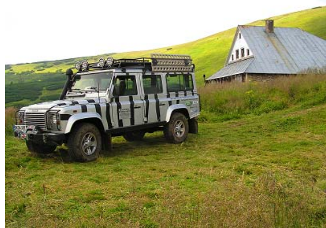
Durkova hut & Land Rover - before the invasion!

Outside we unpacked our food and gas cooker to prepare supper. Everybody was very, very hungry and we looked forward to having a warm meal. Of course we couldn't do without a decent cup o' tea or coffee while waiting. Unfortunately, the gas cooker didn't really manage the amount of spaghetti we wanted to eat and when it was finally done it was a very sticky and slimy white mass. It was pretty unappetising, but none of us cared - we were so hungry - and laughed about it and enjoyed our dinner. Just when the hot water for our after-dinner drinks was ready the hut manager came and said "you've got five more minutes, then everything has to be tidied up and you have to be in the sleeping room'. We looked a bit sheepish, but this is the mountains: 10 o'clock is bed time - no exceptions. So we skipped doing the dishes and threw everything together and packed it into the Land Rover. When we got into the sleeping room we almost got a heat shock. People were everywhere – just everywhere. We stumbled over other people; they were even lying in the aisles. The whole room was cramped with people. The night was quite an experience! I think no one was really sleeping, just dosing - it was just too