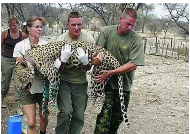
Leopard in blissful ignorance that he is about to hit the headlines.

Our first significant success came when the neighbouring farmer called with reports of two freshly killed oryx on his property. Since leopards often return to their kills to eat again, one of the box traps was immediately moved to the location. Result: one large male leopard in the trap the next morning (a first for Biosphere Expeditions and front page news on the Namibian 'Allgemeine Zeitung' newspaper). The animal being in a good, healthy condition, he was a prime specimen for the darting and immobilisation procedure and thus had the privilege of becoming the first radio-collared leopard in the area. The telemetry teams soon found out that he hung out mainly in a small range of rocky outcrops jutting up out of the savannah to the east of the farm.