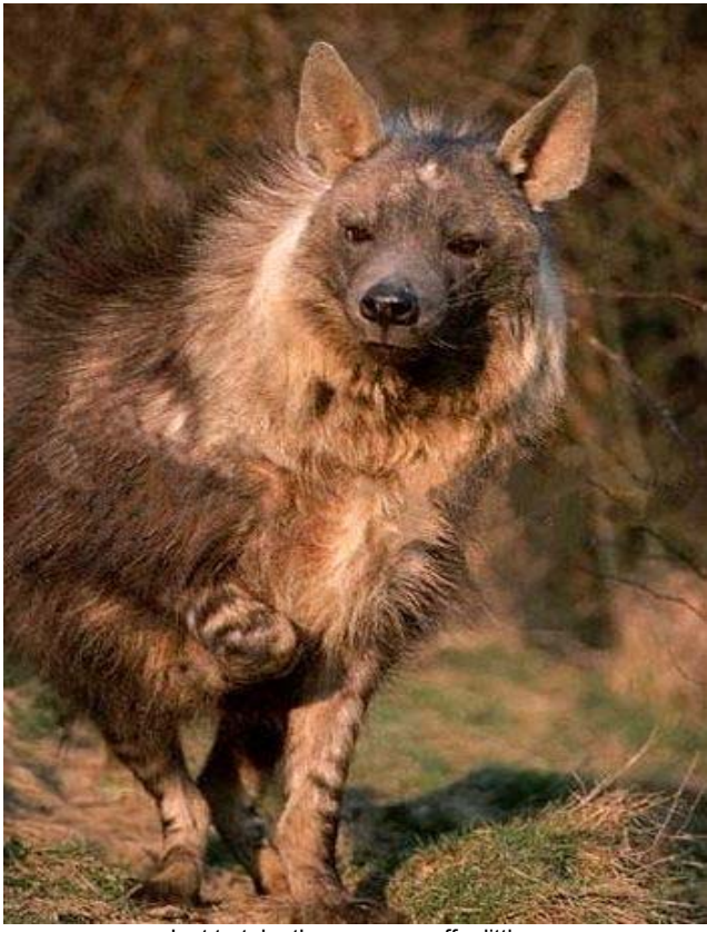
Just to take the pressure off a little – this is what a brown hyaena looks like ;->

along the road late in the evening. We know one of their dens on the farm, but so far very little is known about these cautious animals. The same cannot be said for the baboons who wandered into the traps overnight. We also released a few porcupines and warthogs as well as honey badgers, an aardvark and a caracal. We tried many a marvellous method to encourage the hyaenas into the box traps, but no luck for this species this year. No pressure for the 2006 team, but I'll be following the diary with anticipation. One brown hyaena please!