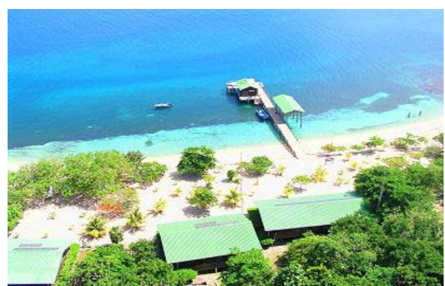
Not a bad place for a research station...

The lead-in for Oman was unusual in that I was approached by a representative of Oman and Gulf Air at an exhibition in Berlin, who contacted local scientists and brokered the first proposal. Once the paperwork was all done, the airline flew me out to Oman first class (the first and probably only time I will have been in seat 1A on a flight!) and gave me the red carpet treatment with suites in hotels for me to "hold court" in. Very unusual and not the customary quinea-pig experience. Once out of Muscat and into the field, things soon approached rodent level again and we spent some days driving through the study site, hiking up and down mountains, looking at possible camp sites and talking to various house owners in the local town about descending on them with an expedition team. Permits were not much of an issue, since the scientist works for the "Diwan" (the Sultan's court), so came with the very highest credentials. We soon had a base, valleys and areas for investigation and a workable research plan. Land Rover Dubai is going to provide the vehicles and I look forward to January. When you read this, I will be out there.