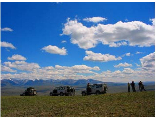
Big sky, great vehicles in the Altai.

Just over three years ago, Land Rover launched its "Fragile Earth" policy, aimed at all drivers who venture off road. The policy 'affirms Land Rover's continuing commitment to the environment' and 'gives important guidelines that should help all owners treat the environment more kindly.' It is a global promise to minimise the damage to the environment done by those driving Land Rovers. In practical terms, it states that the company will do all it can to ensure its activities are environmentally sound, from design and construction of vehicles to providing training in how to drive responsibly off-road.