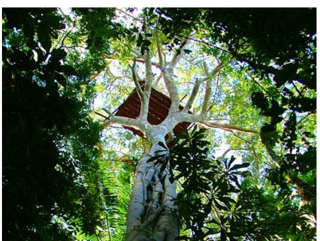
The 'crazy Kiwi' platform high up in the canopy.

We will also be doing long watches from the canopy platform constructed by some crazy Kiwi volunteers in 2005.