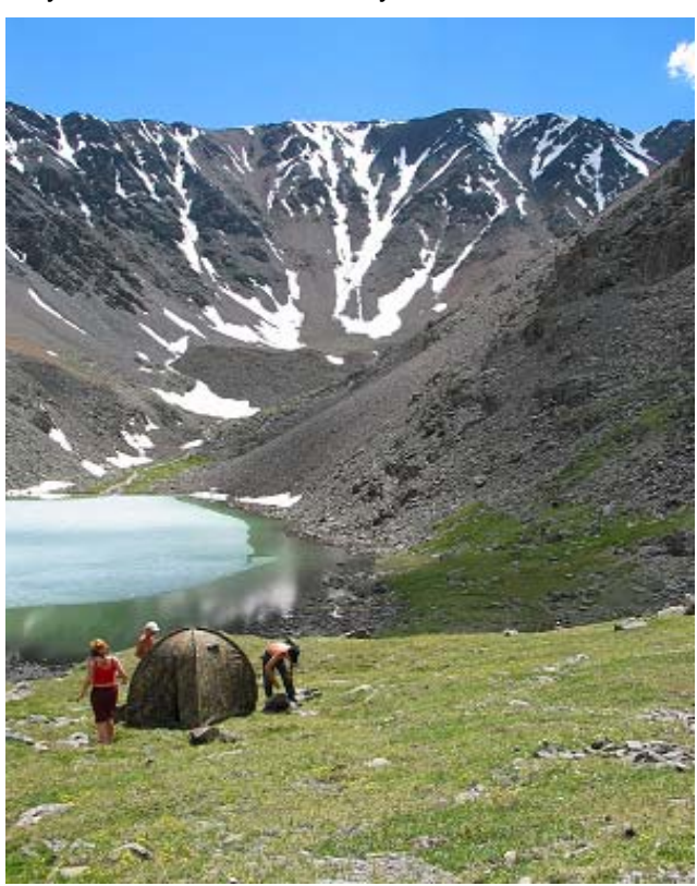
Corridor area observation post.

Mosquitoes biting before breakfast. It's the price we are paying for this warm weather. Many team members out with Andrei and Nastya to see burial mounds and standing stones in the 'valley of a thousand stones'. They are so diligent they can't stop surveying so I've got some data sheets to go over soon. Helge back from the hide this afternoon delighted. He was woken at 5 am by an Altai snowcock and got great sightings and footage. As if that wasn't good enough, he also got really good and close views of ibex (nine in total - five adults and four young) and was able to record lots of behaviour. No wonder he and Ivan tripped down the valley in record time (1 hour and 20 minutes with heavy packs!!!). I just want to go to the hide right now. The overnight group is due back this evening. Who knows what they will have found? Will let you know.