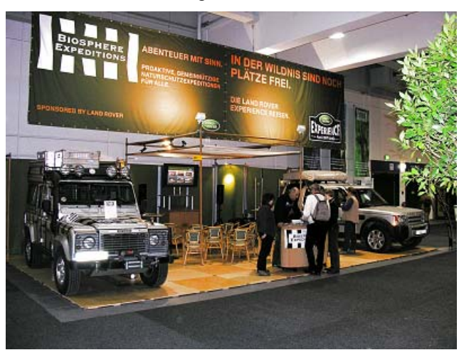
Our stand at the ITB.

In March we attended the ITB (International Tourism Bourse) together with Land Rover. The ITB is the world's biggest tourism market and a very good opportunity for making new contacts or to build on existing relationships. In fact our Oman expedition is a direct result of making a contact at the ITB.