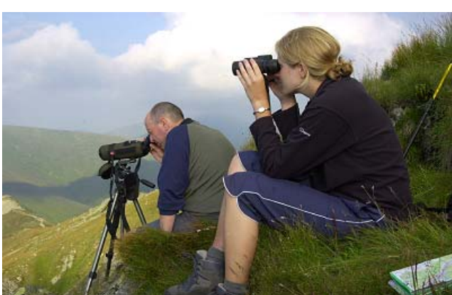
Mountain observation post.

The next time I looked up. I realised that I had lost my team. It was a bit scary, since there was only 'white air' around. I shouted and whistled, but no reaction from my team. I thought: "Oh my, will I ever find the others again?" and then "ahh well, I'm Biosphere staff and I can't be a wimp. Eventually I will find somebody or find the hut again." So I continued and of course found my team again pretty quickly. Heading on the mist suddenly cleared and we spotted a lone male chamois straight away and spent some time observing him. Further east there was still more to see and observe: we found a red deer mother with her baby, heard marmots whistling and later that afternoon spotted a group of about eight chamois heading towards the ridge and another single chamois standing cheekily on the footpath. We would have liked to go further, but knew that we had to turn back to be at the hut before sunset.