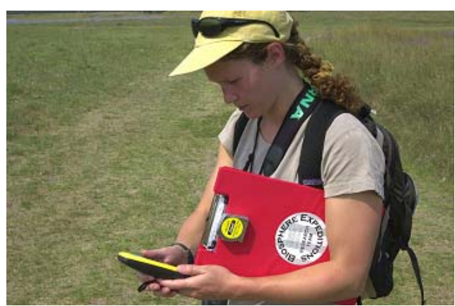
Which way was north? The author grappling with a GPS

issue is much more complicated and involves creating a culture on expedition. We need to be particularly careful of how people (and I mean all the people involved in the expedition, from the team members, to the cooks, to the expedition leaders) are properly involved once they are out in the field. People need to feel that they are part of a team, that their views are important, that they have a crucial part to play and most importantly of all, that any question is a good question. If we can have a culture on all our expeditions where people feel that they can ask anything (and give any view) and that they will be listened to and that their contribution will be valued, then I think that people will feel completely involved. They can be sure that they know everything that they need to know in order to be able to contribute effectively to the scientific work of the team. And that, after all, is what it is all about.