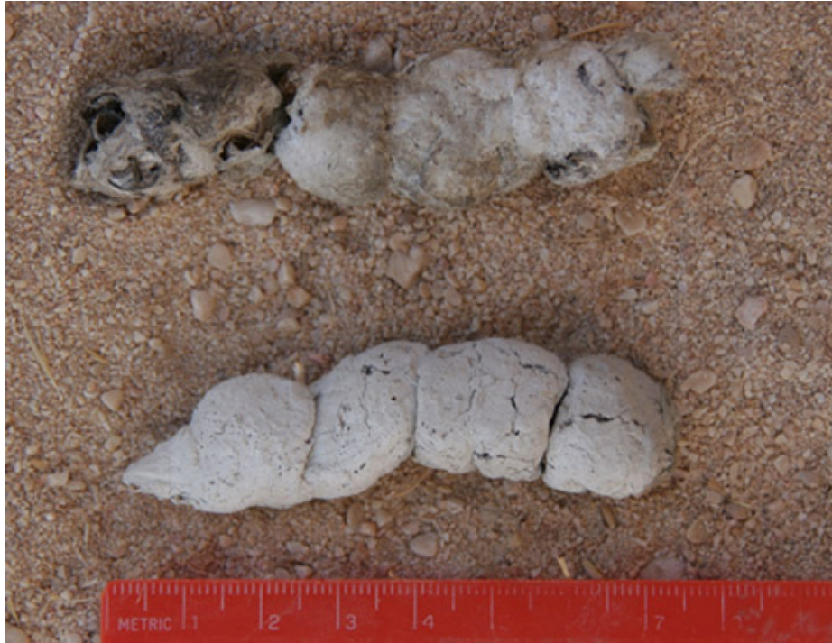
Fig. 4. Typical leopard scat, found during the survey in the study area.

Although no fresh evidence of the leopard was found, evidence of the presence of its most important prey species was abundant. The gazelle (51 records in 29 cells), ibex (46 records in 27 cells), and hyrax (51 records in 30 cells) were found in more than half of the cells surveyed. The presence of hyena (23 records in 16 cells), a carnivore with large resource requirements, also suggested that the study area provides suitable habitat for large predators. Volunteers were asked to record the presence of a species only once for each cell, thus the larger number of records than the number of cells means that some cells have been either re-sampled in different occasions, or simultaneously sampled by multiple volunteer groups.