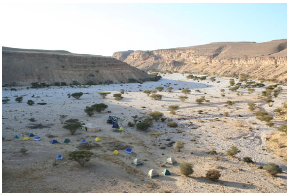
Fig. 2. Overview of the main base camp in the bottom of Wadi Amat and among the acacia trees. Escarpments are also shown.

and the leopard approximately 20 km south of the study area. The study area is largely uninhabited and expected to be a good habitat for the Arabian Leopard and its prey (SPALTON et al. 2006). It is also known to harbour the Nubian Ibex Capra nubiana (F. Cuvier, 1825) (IUCN - vulnerable), the Arabian Gazelle Gazella gazella (Pallas, 1766) (IUCN - Vulnerable), the Hyrax Procavia capensis (Pallas, 1766) (IUCN – Least Concern) and top carnivores such as the Arabian Wolf, the Striped Hyaena Hyaena hyaena sultana (Pocock, 1934) (IUCN – regionally threatened) and the Caracal Caracal caracal schmitzi (Matschie, 1912). Dromedaries Camelus dromedarius (Linnaeus, 1758), known in the area simply as camels, can be found almost everywhere. Contrary to earlier suggestions, there is some evidence that they were once living as wild animals throughout the Arabian region (NOWAK 1999). Umbrella thorn acacia Acacia tortilis (Forskål) dominates on the bottoms of the wadis (Fig. 2).