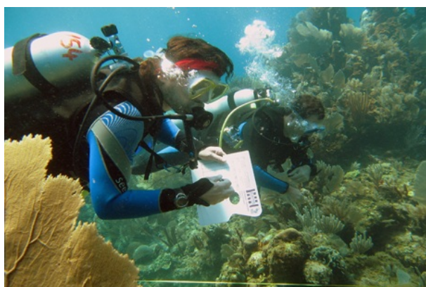
Diver collecting data

All divers who lend a helping hand will be guided by marine scientists from the Maldives, UK and Germany who will train and oversee their work.