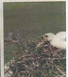
STEPPE EAGLE EYRIE: These of plenty of prey in the area. As part work of the Siberian Environment feathers for DNA an