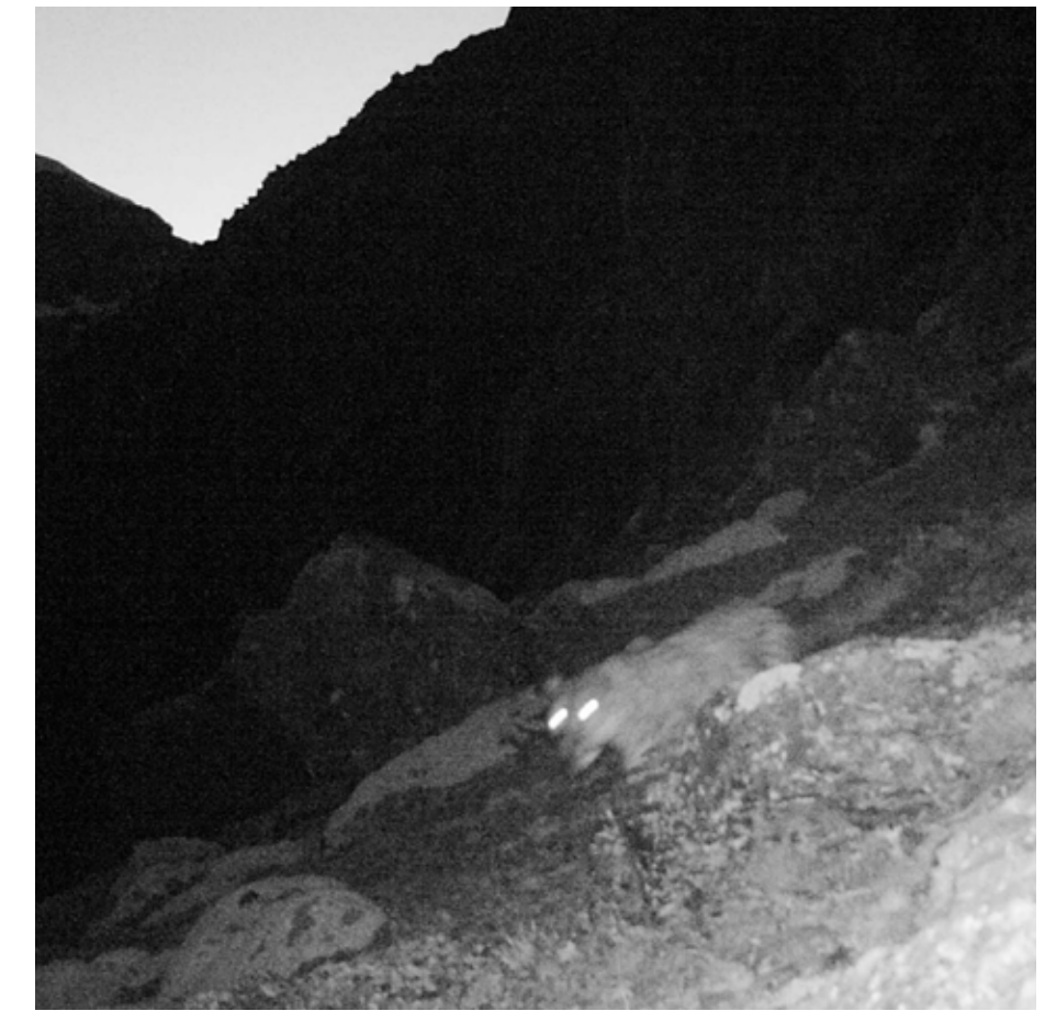
Ghostly image of a snow leopard caught by an expedition camera trap in the Tien Shan mountains, 2018.